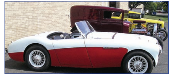
Fall Car Show - Granite Falls