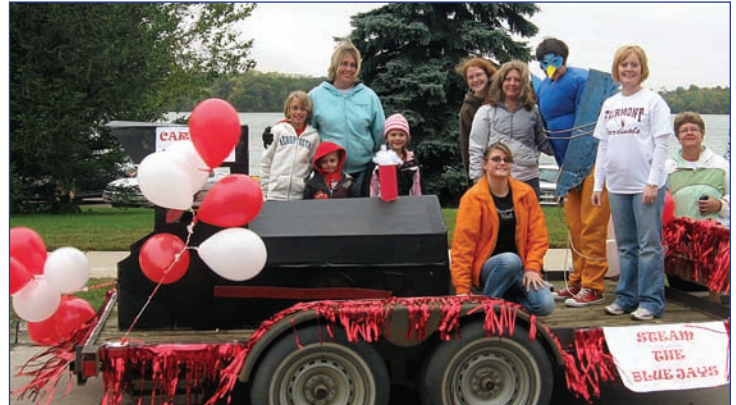
Fairmont High School Homecoming Parade float