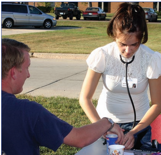
Night at the M&M - Pipestone

The Pipestone Campus participated in a “ Night at the M&M ” on September 15th. The Night at the M&M, which stands for Minnesota West and the Pipestone National Monument. The event, sponsored by the Active Living Partnership, included walking 3 miles on the paths between Minnesota West and the Monument. Before and after the walk, Minnesota West nursing students checked blood pressures and blood oxygenation. After the hike participants could treat themselves to a chair massage offered by the Pipestone Campus massage therapy students.