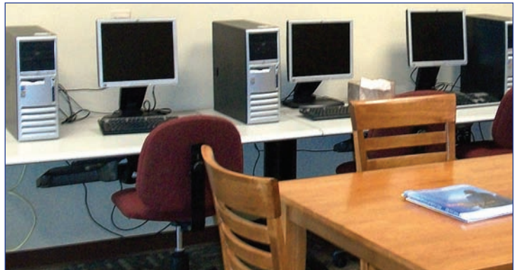
Redwood Falls computer lab