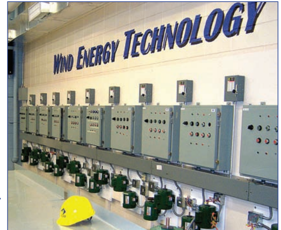
Canby electrician and wind energy lab facility