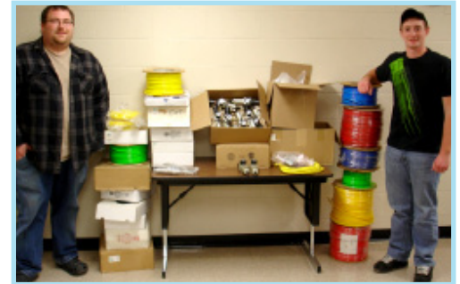
Granite Falls Fluid Power donation

The Fluid Power program on the Granite Falls Campus received equipment donations from Hartfiel Automation, Pneumadyne and Pneu-Motion – all three businesses are operated by fluid power graduates. The equipment will be used by the students in their training.