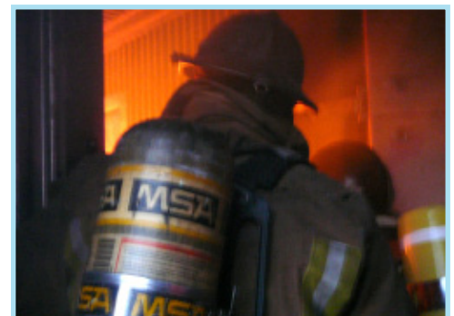
Live burn structure fire simulator

The Customized Training Services Fire Safety Training program launched its new live burn structure fires mobile training simulator in March, 2012 at the final training sessions for the Dawson and Hendricks Fire Departments. The structure fires simulator is equipped with two separate live burn rooms to simulate a two room fire, insulated stainless steel panels, thermo-couplers for tracking the temperature and heat during the training, and built in sprinklers for extinguishing the fires. According to Daryl Bartholomaeus , Fire Safety Training Coordinator "This is a significant improvement in the quality of the training we are able to provide to our fire fighter's throughout our region and allows us to monitor and control the safety of the training environment for everyone involved."