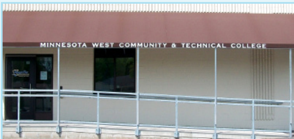
Redwood Falls Learning Center

The Legacy Society allows a person to make a substantially larger gift to the students and programs at Minnesota West than they could during their lifetime. Contact the foundation office at 507-223-7252 if you are interested in these opportunities.