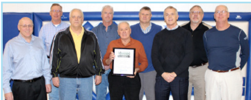
1971-72 Minnesota West Men's State Basketball Champions