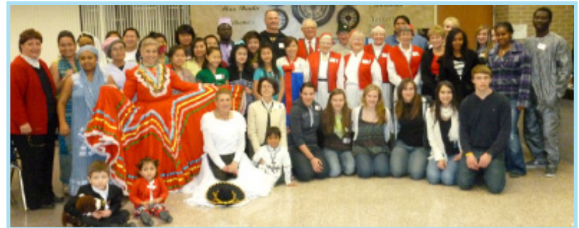
Culture Corner Holiday Event

The Minnesota West Foundation hosted Alumni Weekend in February on the Worthington Campus. The highlight of the weekend was the celebration of the 1971-1972 Men's Basketball State Championship as well as the 1991-1992 Women's Basketball State Championship.