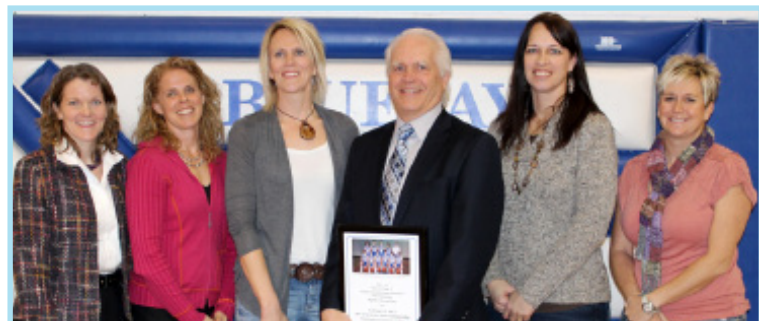
1991-92 Minnesota West Women's Basketball State Champions