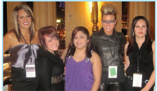
Cosmetology students - Jackson Campus