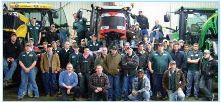
Diesel Technology - Canby Campus

Thanks to the generous support of our students, staff, industry and community 2011 proceeds reached over $5,000! This money will be used for program field trips, competitions, and student scholarships. With a move into a newly remodeled building, the Diesel Technology program will gain 2,000 square feet of shop space. "We are extremely excited for the move into the new building and how it will enhance our learning environment," stated Instructor Peter Girard .