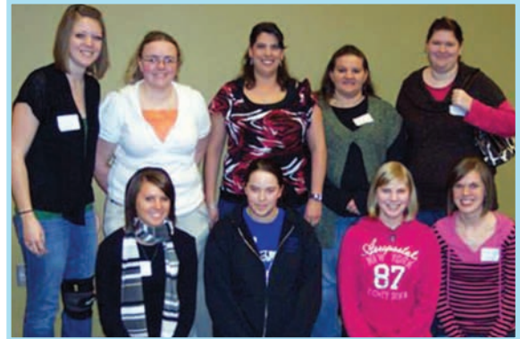
Child Development students