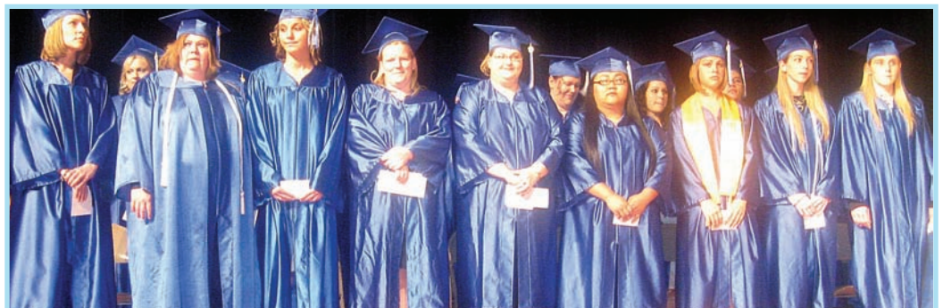
Granite Falls Graduation Ceremony