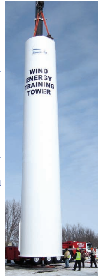
Canby Wind Energy Training Tower

A new wind energy training tower was set into place on Friday, February 19, 2010 on the Canby Campus. The training tower will be utilized by the Wind Energy Technology program to provide further hands-on technical instruction related to climb safety and rescue training for students enrolled in the program. The Training Tower became a reality last fall with a donation from AES Wind Generation of Lake Benton, MN. SMI & Hydraulics, Inc. of Porter, MN designed and built a unique dome top with external tie off points and hatch, in addition to adding a new ladder unit and a rail-slide system, internal platforms, lighting, and a fresh coat of paint. In the coming months, an Avanti Wind Systems Lift Cage , which was previously donated to the program, will be installed. The Wind Energy Training Tower has a base diameter of approximately 13 feet and stands nearly 80 feet tall. Graduates from this program are trained as Wind Energy Technicians, capable and comfortable working under minimal supervision to carry out complex daily assembly, service, repair, and operations of infrastructure to Wind Turbine generators and related equipment.