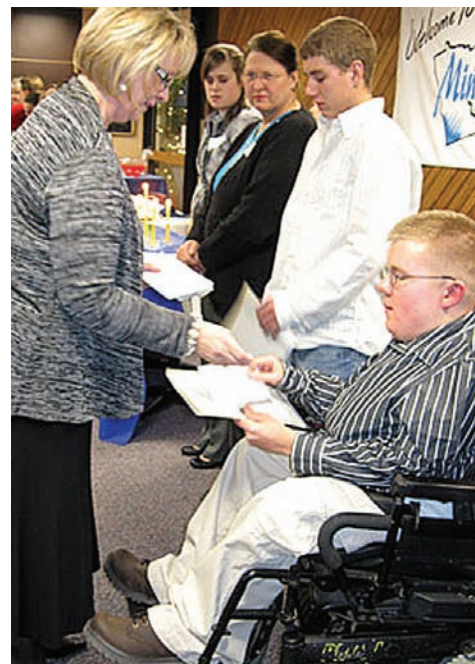
Phi Theta Kappa Ceremony